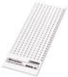
Marker cards, Card, white, Unlabeled, Can be labeled with: Plotter, Mounting type: Snap into tall marker groove, Snap into flat marker groove, For terminal block width: 6.2 mm, Lettering field: 6 x 6.1 mm

Marker cards - SBS 6:UNBEDRUCKT - 1007222