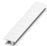
Zack marker strip, Strip, white, Labeled according to customer specifications, Mounting type: Snap into tall marker groove, For terminal block width: 6.2 mm, Lettering field: 6.15 x 10.5 mm